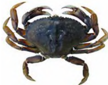
White-tipped claws, brownish shell